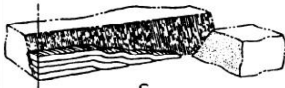
C CASCADE SEQUENCE